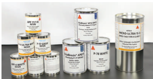
Sika's polyester filling and fairing resin components are packaged conveniently in quart, gallon, and 3-gallon containers.

Sika's polyester filling and fairing compounds are two-component systems, consisting of a polyester resin and benzoyl peroxide (BPO) cream hardener. They are excellent for everyday filling and fairing applications, providing fast sanding times, with select technologies offering high temperature resistance, flame retardancy, or below waterline capability. All polyester filling and fairing compounds are mixed 100 parts by weight of resin with 2 parts BPO.