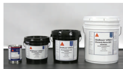
SikaBiresin® AP861-1 Part B hardener packaging