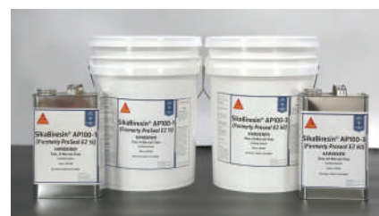
SikaBiresin® AP100-1 and AP100-3 Part B hardener packaging