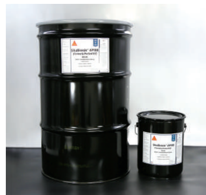
SikaBiresin® AP100 Part A resin packaging

(B) Tests with actual materials and conditions have to be performed to ensure satisfactory performance. Substrates must be roughened and cleaned prior to use to promote adhesion. All technical data stated in this table is based on laboratory tests. Actual measured data may vary due to circumstances beyond our control.