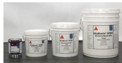
SikaBiresin® AP861 Part A resin packaging