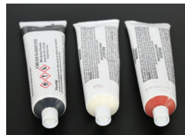
Sika offers BPO cream hardeners in black, white, and red in 1-ounce and 4-ounce tubes.