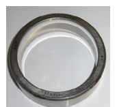
NYCO GREASE® GN 3058