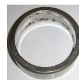
MARKET REF (LIX)