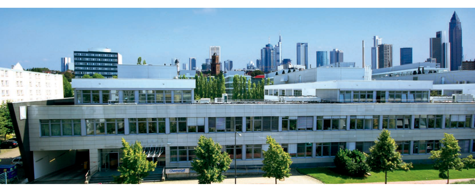
Chemetall Company Headquarters: Frankfurt am Main, Germany

As one of the leading global players, Chemetall focuses on surface treatment technologies in all their facets. Quality products and services are the prerequisite of our business success. However, at Chemetall, we know that it takes more than that to be a preferred global supplier.