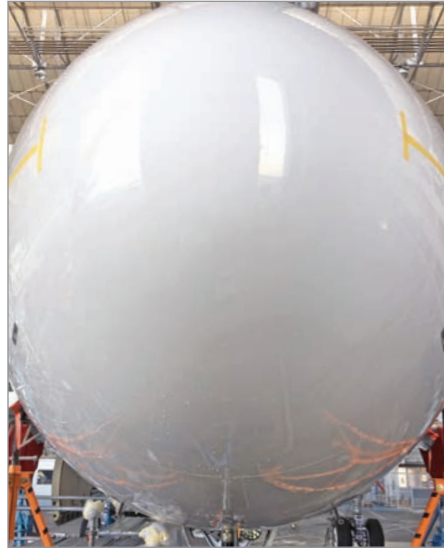
Protective boot installation on radome with internal static diverters.