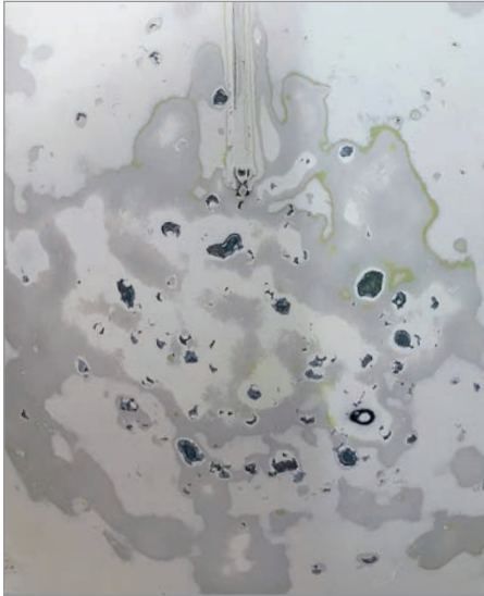
Close up view of damaged radome flow without protective boot installed.