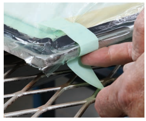
Works outside the bagging area to securely hold/position bagging materials and thermal couple wires while providing clean removal from tooling post cure.