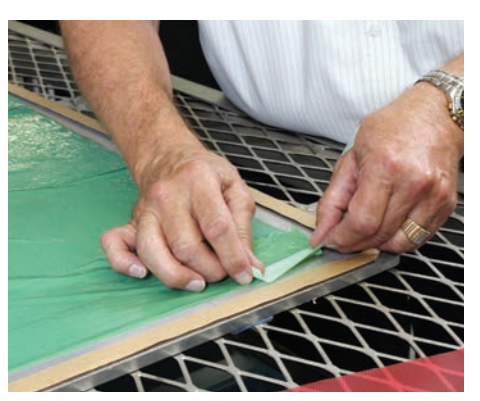
Works inside the bagging area to securely hold/position laminate plys, release liners, bagging materials and thermal couple wires while providing clean removal post cure.